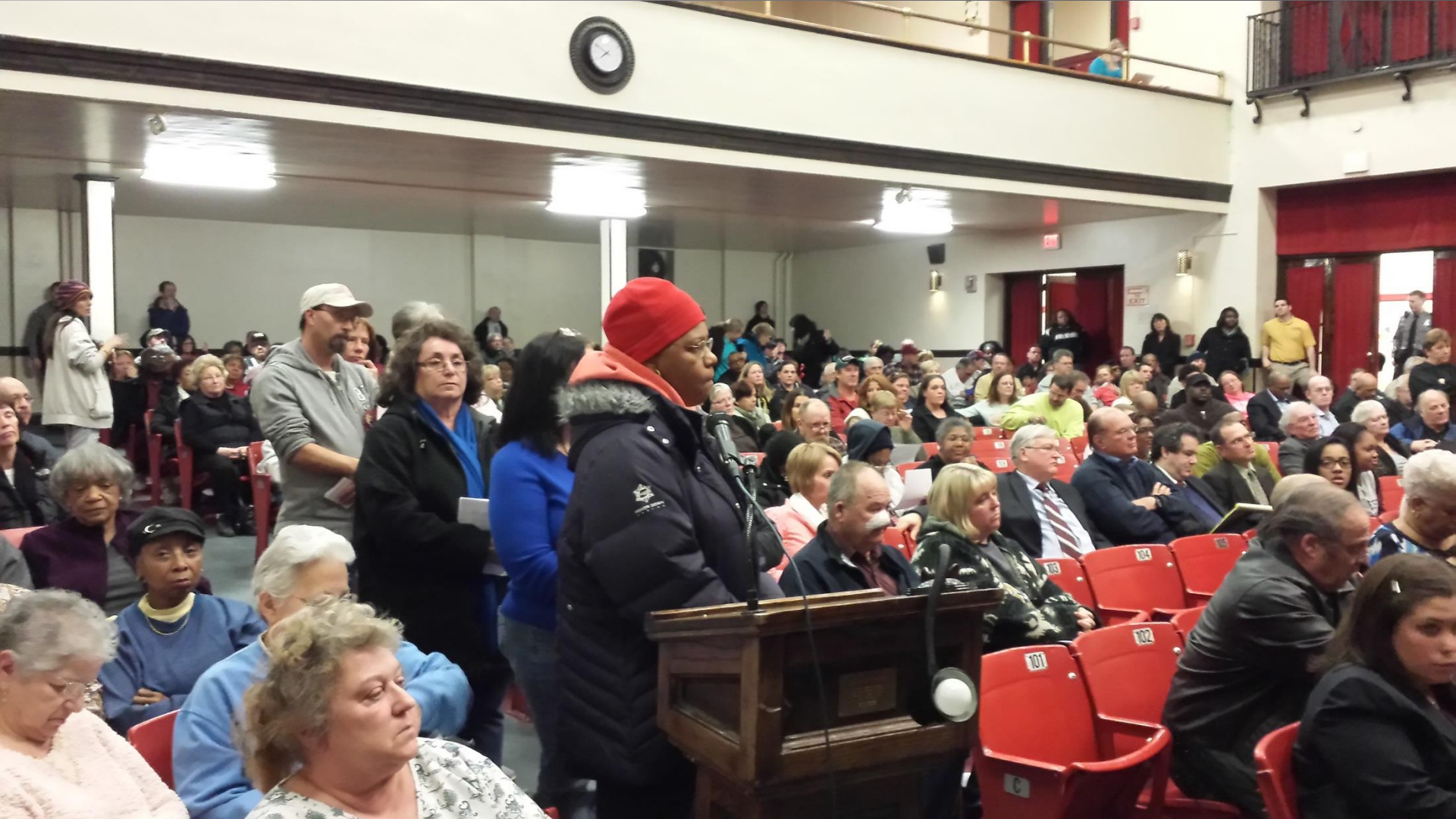
Public Meeting Paulsboro New Jersey