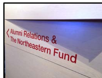
Signage has been installed.