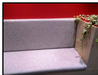
Felt cushion in place at the seating area.