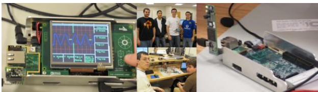
Figure 3. NEU Projects – Signal Analyzer, Wireless Audio

When surveyed, 80% of the students indicated that having a personal active learning platform would be very beneficial to their academic progress. They gave concrete examples of “developing at home”, “some debugging ahead of time”, and “playing at home”. Only one student was indifferent and cited time limitations as a restriction.